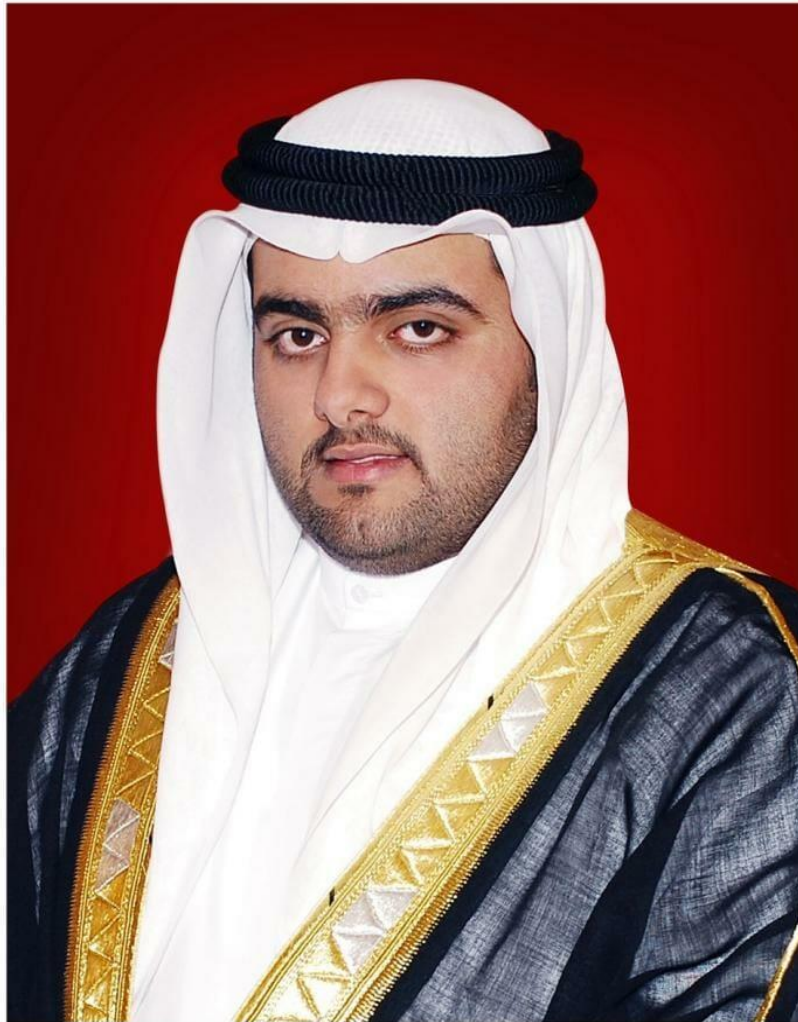
شمس الدين محمد بن محمد السرفي ولي عهد إمارة الفجيرة