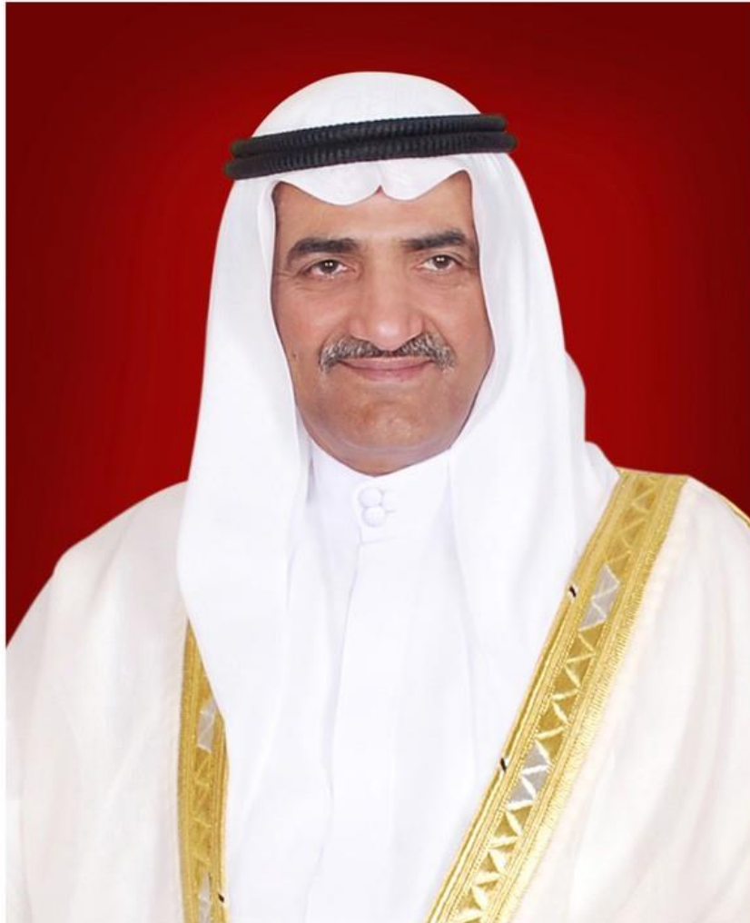
صالح بن السموال شيخ محمد بن محمد الشريف عضو المجلس الأعلى حاكم الفجيرة