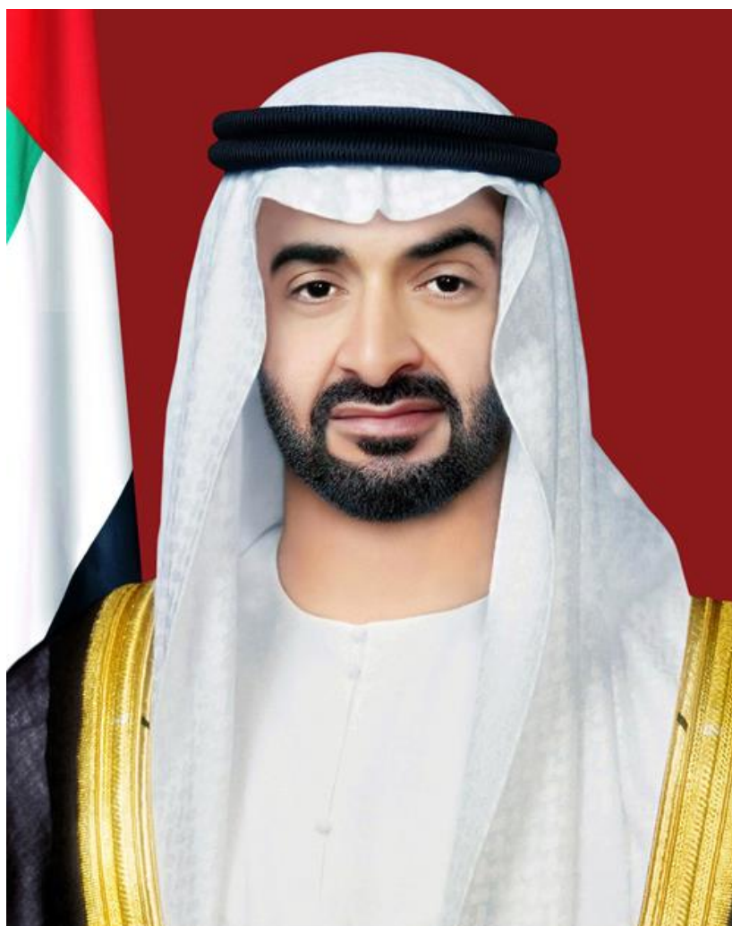
معاليه الشيخ محمد بن زايد آل نهيان رئيس دولة الإمارات العربية المتحدة HIS HIGHNESS SHEIKH MOHAMMED BIN ZAYED AL NAHYAN PRESIDENT OF THE UNITED ARAB EMIRATES